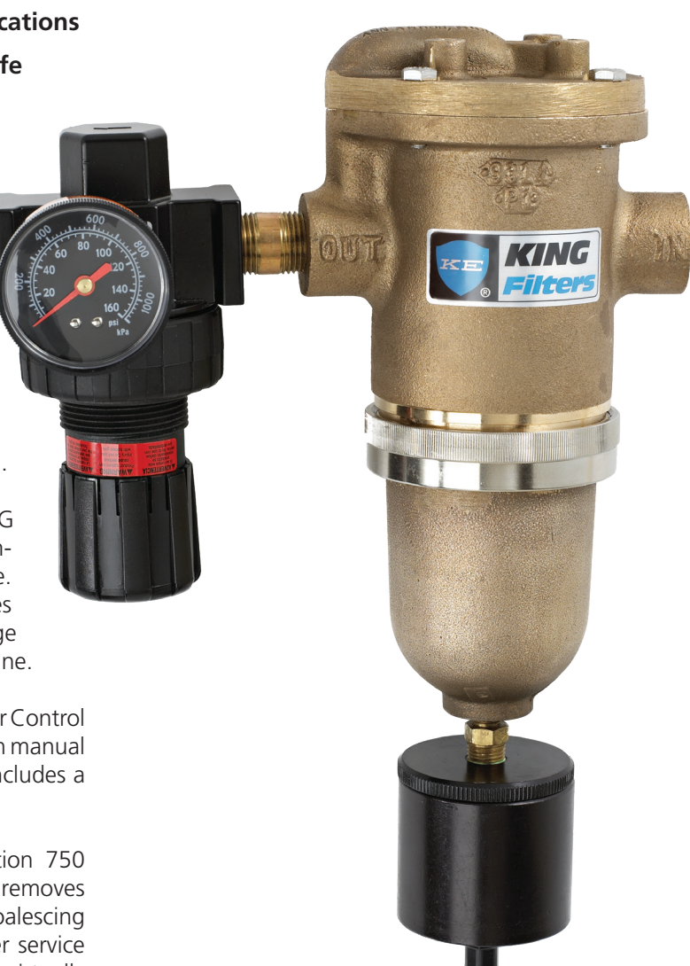
KING Air Control Station with Automatic Drain

Ensure clean air with our two-stage combination 750 Scrubber and 800 Polisher cartridge set which removes 99.7% of particulate down to 0.1 micron. The coalescing action in the first stage cartridge provides longer service for both cartridges elements while delivering dry, virtually oil-free compressed air. KING Filter cartridges provide equal efficiency regardless of flow rate and do not diminish during the life of the elements. (Assumes periodic draining of sump or use of automatic sump.)